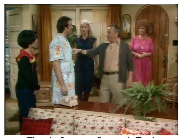
Three's Company Season 1, Ep. 1